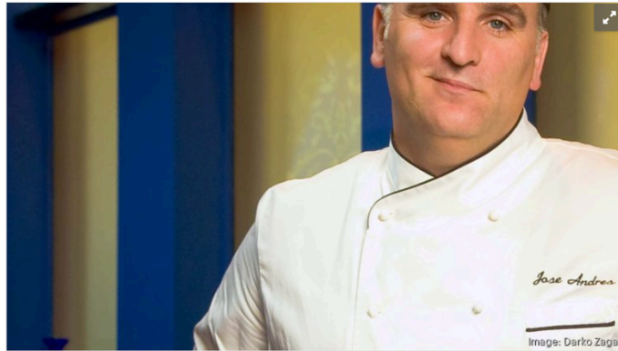
Jose Andres

The Spanish-American chef has also earned Bib Gourmand designations for four of his restaurants in addition to 13 James Beard Foundation nominations and awards.