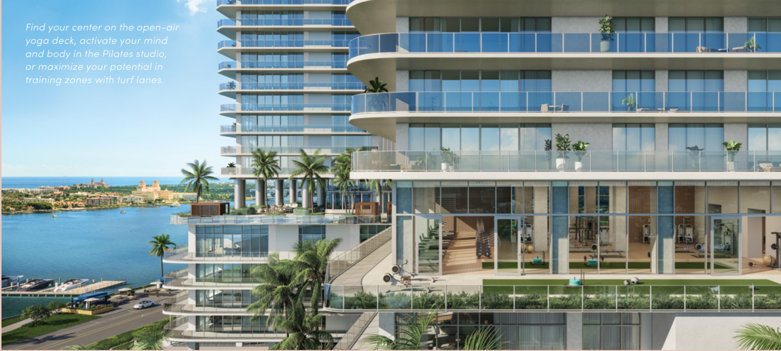
Find your center on the open-air yoga deck, activate your mind and body in the Pilates studio, or maximize your potential in training zones with turf lanes.