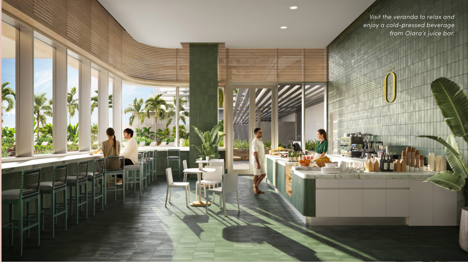
Visit the veranda to relax and enjoy a cold-pressed beverage from Olara's juice bar.

Discover a taste for every palate at an indoor/outdoor restaurant by world-renowned Chef José Andrés, the first José Andrés Group restaurant in the Palm Beaches. Or set out from the private, six-slip dock to enjoy an adventure on the Intracoastal Waterway. The opportunities are endless.