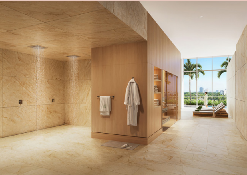
The relaxation room at Olara's world-class spa offers luxuriously comfortable chaise lounges and serene views.