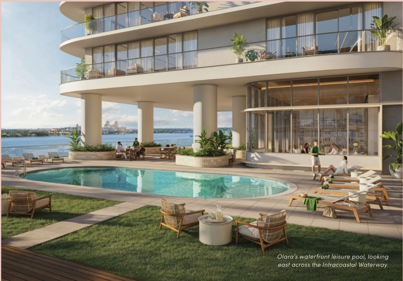
Olara's waterfront leisure pool, looking east across the Intracoastal Waterway.