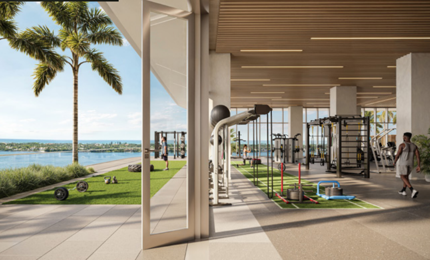
State-of-the-art equipment allows you to balance high-performance training and high-end recovery.